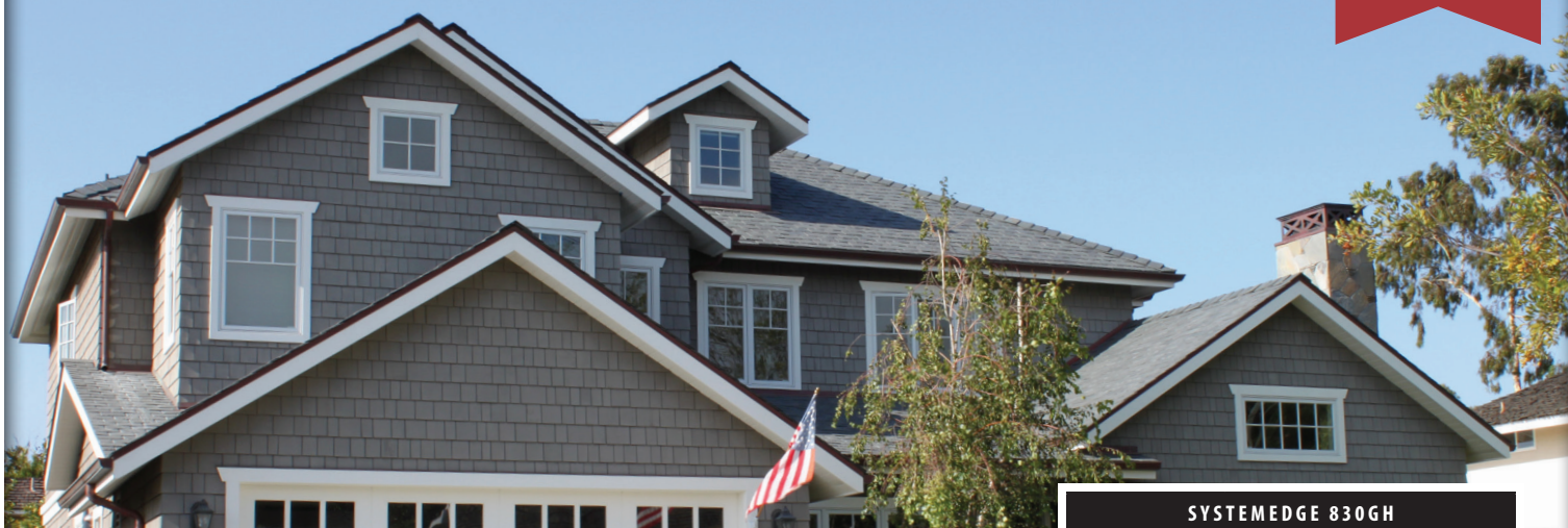
OUTBACK POWER GRID-TIED/BACKUP PACKAGES