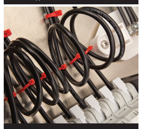
OutBack's FLEXware ICS Plus combiner solution is UL 1741 and NEC 2014 compliant.

OutBack's Radian Series inverter/chargers are engineered for maximum performance in gridinteractive applications.